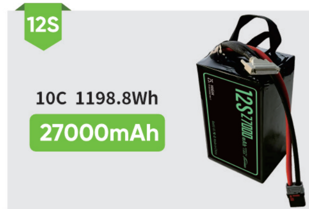
Battery Dimension: 213*122*90mm Battery Weight: 4.69Kg