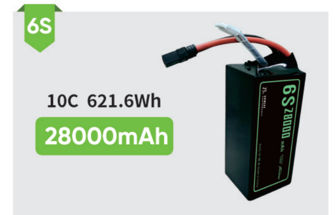
Battery Dimension: 194*77*65mm Battery Weight: 2.00Kg