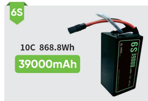
Battery Dimension: 210*90*68mm Battery Weight: 2.72Kg