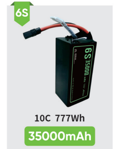
Battery Dimension: 214*91*63mm Battery Weight: 2.52Kg