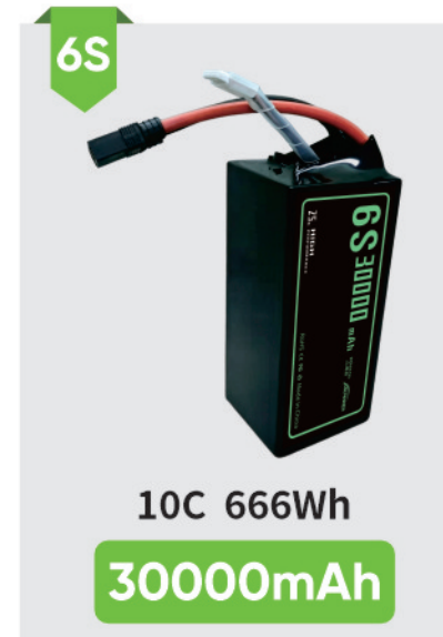
Battery Dimension: 213*90*67mm Battery Weight: 2.64Kg