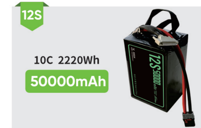
Battery Dimension: 228*135*107mm Battery Weight: 2.31Kg