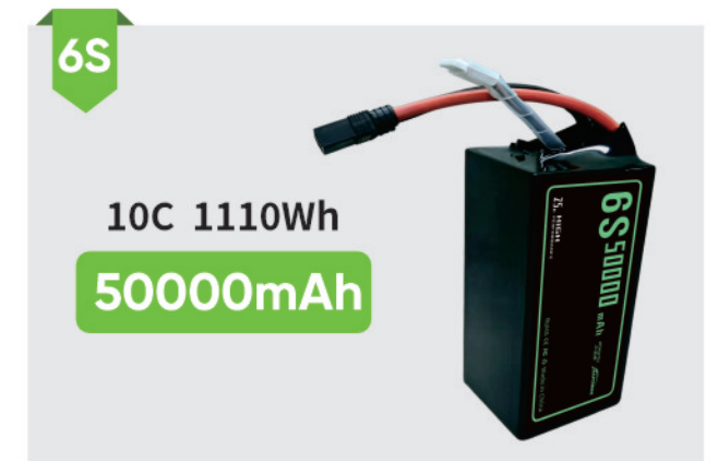
Battery Dimension: 253*107*68mm Battery Weight: 3.74Kg