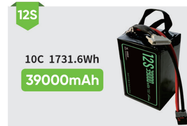
Battery Dimension: 211*135*90mm Battery Weight: 5.30Kg