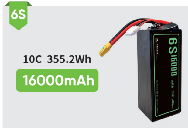
Battery Dimension: 195*76*49mm Battery Weight: 1.56Kg