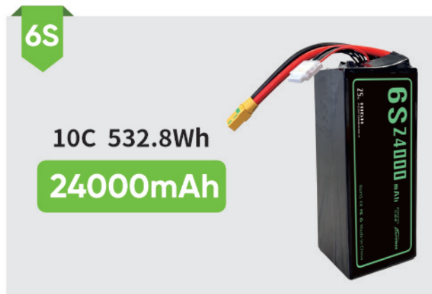
Battery Dimension: 197*78*66mm Battery Weight: 1.94Kg