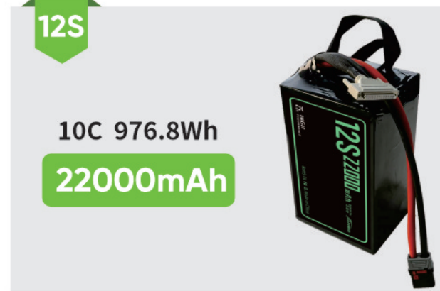
Battery Dimension: 195*130*76mm Battery Weight: 3.94Kg