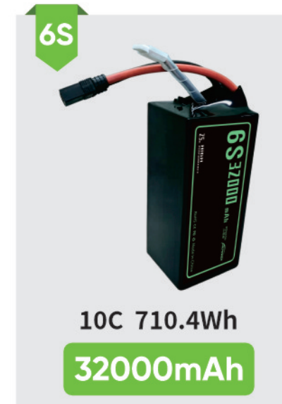
Battery Dimension: 210*90*68mm Battery Weight: 2.44Kg