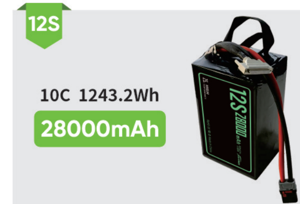
Battery Dimension: 198*135*77mm Battery Weight: 3.91Kg