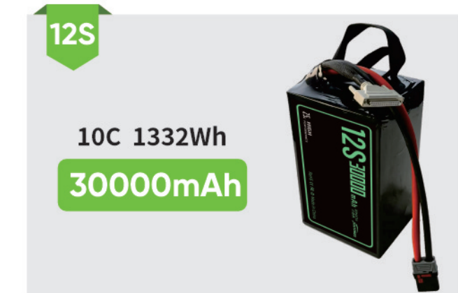
Battery Dimension: 213*135*90mm Battery Weight: 5.19Kg