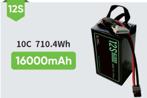
Battery Dimension: 195*98*76mm Battery Weight: 2.97Kg

Stable Under Heavy Load Tasks Heavy-Duty, High-Load & Agriculture