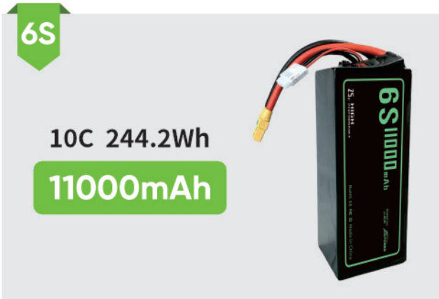
Battery Dimension: 148*66*50mm Battery Weight: 1.04Kg

22.2V 11-50AH Stable Output Lightweight Platform Small & Medium UAVs