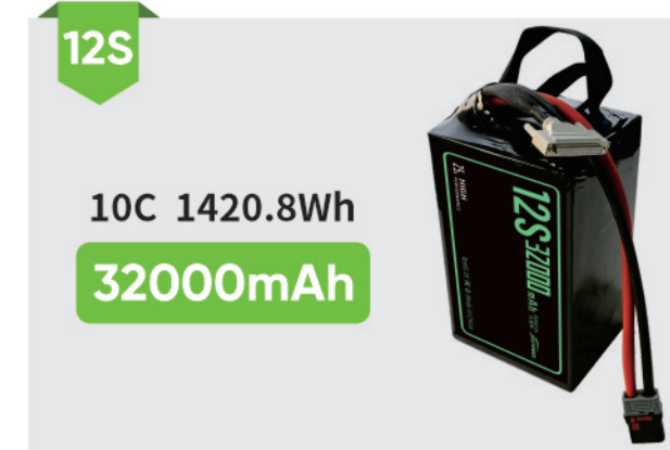
Battery Dimension: 210*135*89mm Battery Weight: 4.77Kg