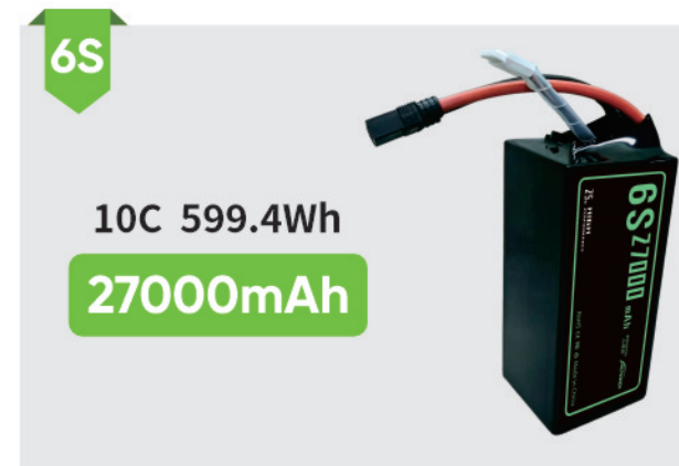
Battery Dimension: 213*90*61mm Battery Weight: 2.37Kg