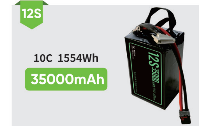
Battery Dimension: 213*125*90mm Battery Weight: 5.19Kg