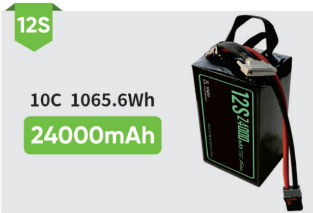
Battery Dimension: 198*135*77mm Battery Weight: 3.74Kg