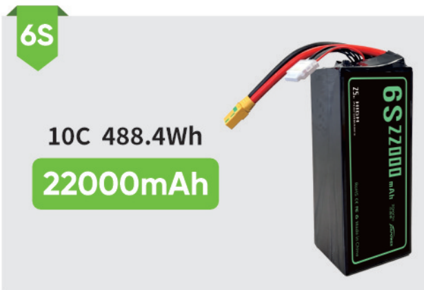
Battery Dimension: 195*76*64mm Battery Weight: 1.97Kg